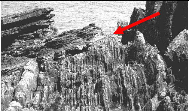
The Hutton Unconformity....the first proof of “deep time” Scale: bottom edge of picture is 10 feet across

amazing scenery and geological history seen in Scotland. Today we journey to Siccar Point and the most historically famous outcrop in the world: James Hutton’s “unconformity” . Then lunch in Dunbar, a harbor town on the estuary of Firth of Forth that was the home of John Muir (now a museum). Along the coastal cliffs are volcanic pipes and an interesting array of sedimentary formations similar to our Pennsylvania. The final stop of the day will be the pretty seaside town of North Berwick. Overnight in Edinburgh. Day 12 Tues., Sept. 22. St. Andrews – We will bus to a coastal walk to view volcanic vents,