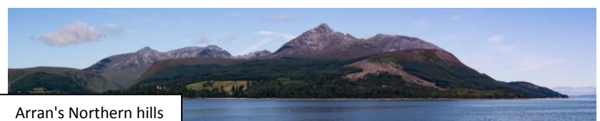
Arran's Northern hills

Travel to the Isle of Arran with 3 nights lodging at the Auchrannie Resort. It is a 3 hr. bus ride to the ferry, and then about an hour to get to Arran. The