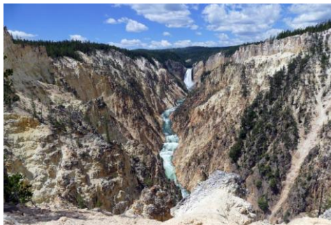
Grand Canyon of the Yellowstone